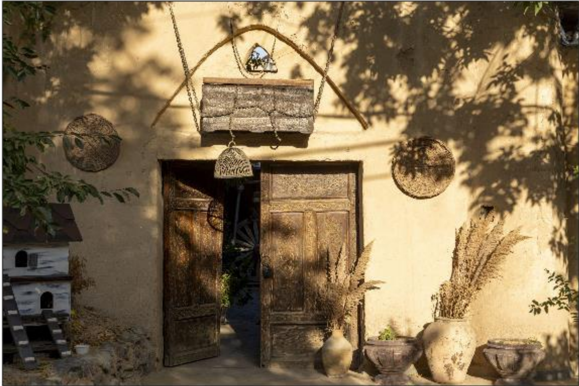
10 - Tashkent