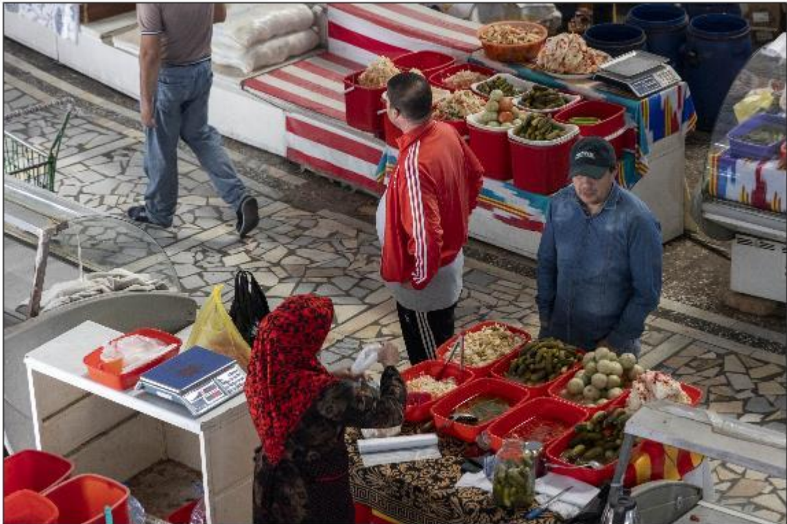
21 - Tashkent