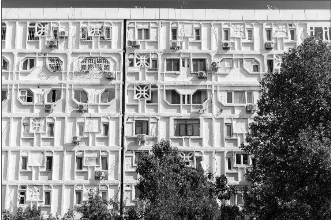
04 - Tashkent