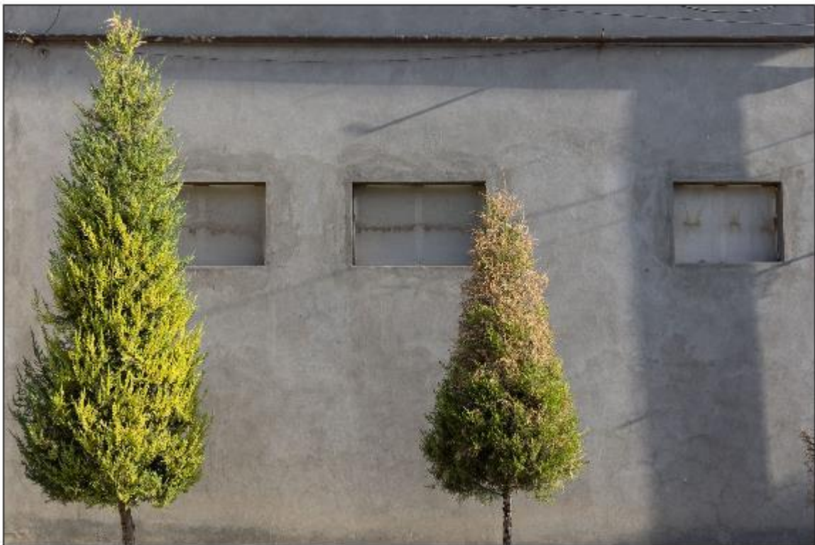
07 - Tashkent