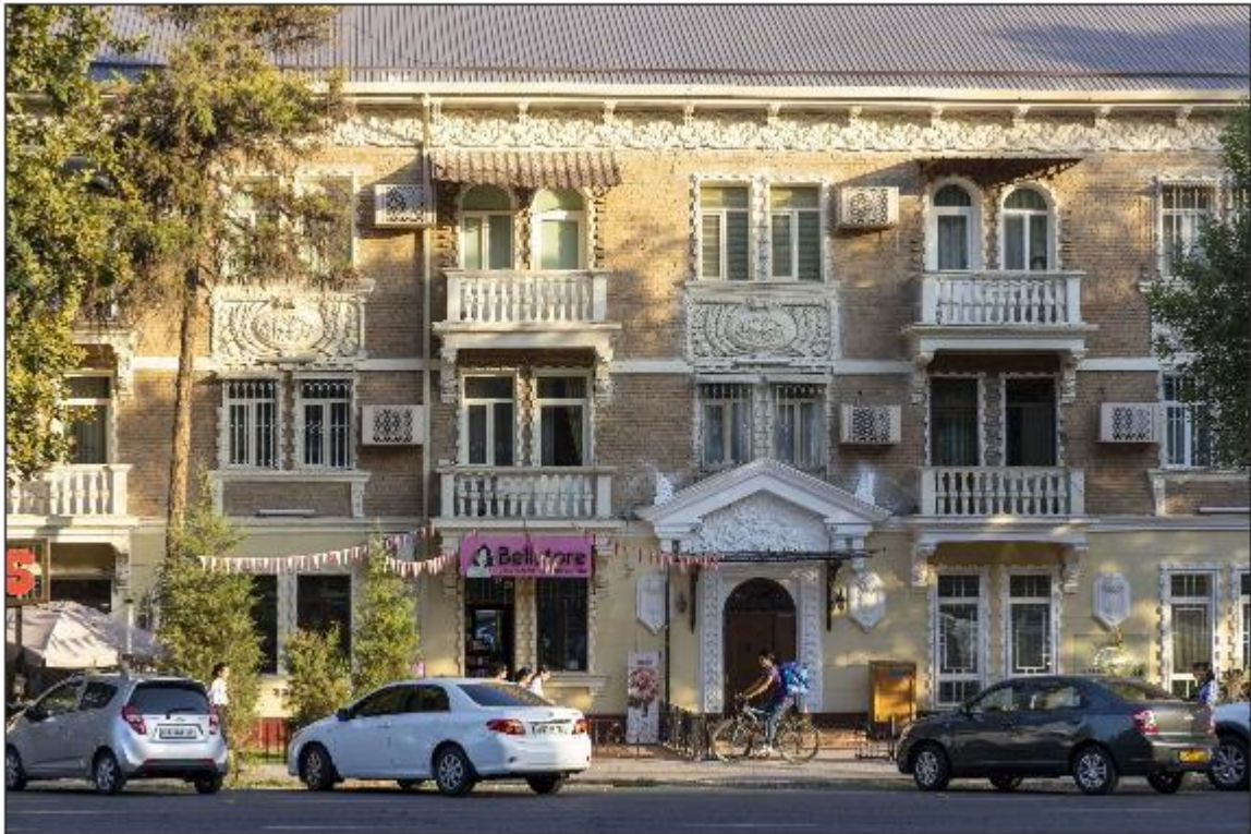
12 - Tashkent