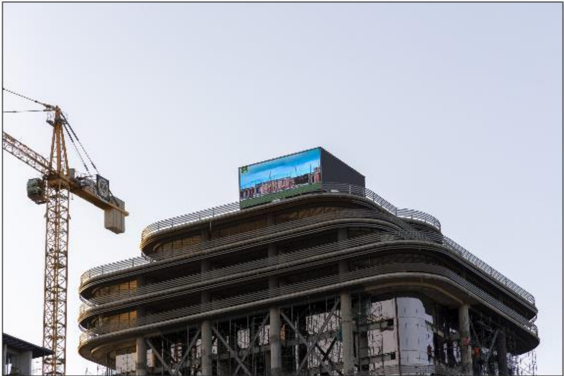
16 - Tashkent