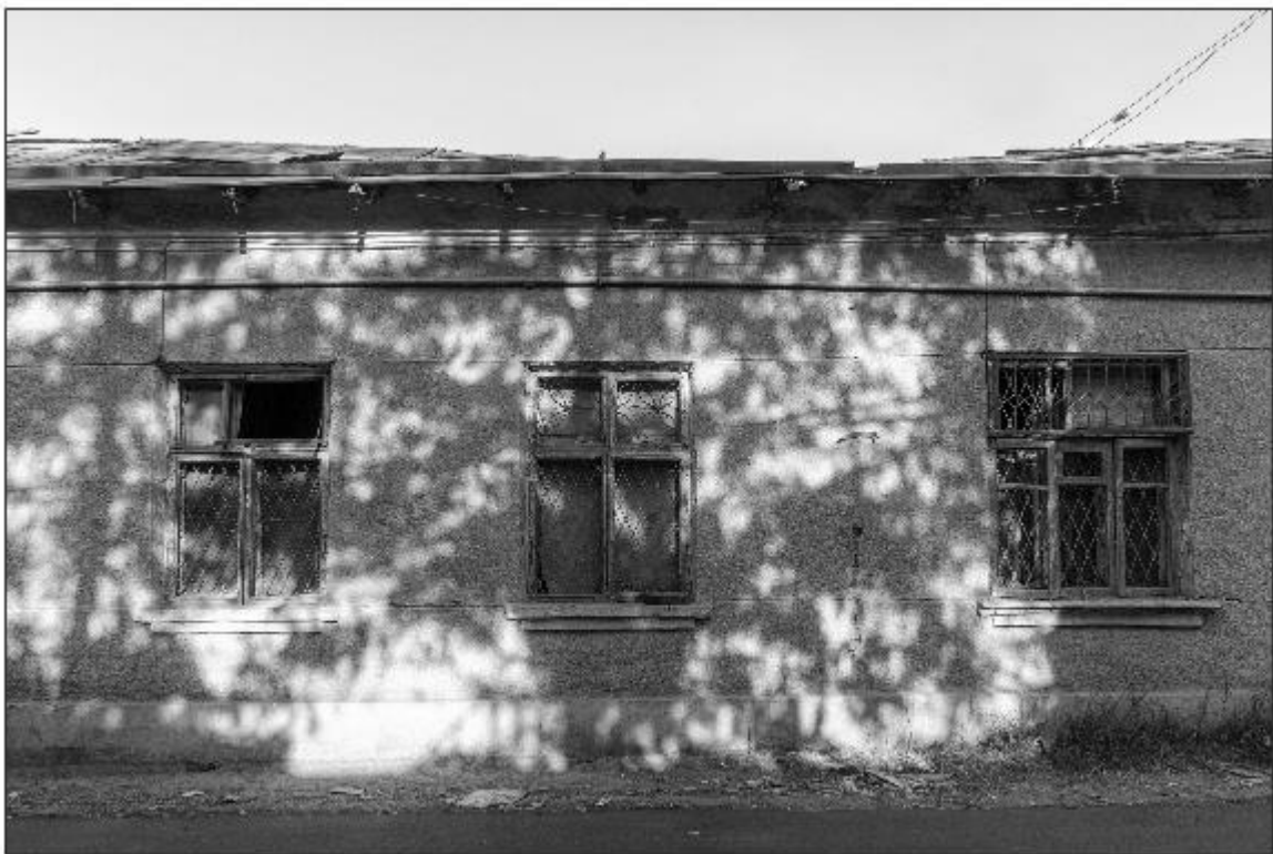
09 - Tashkent