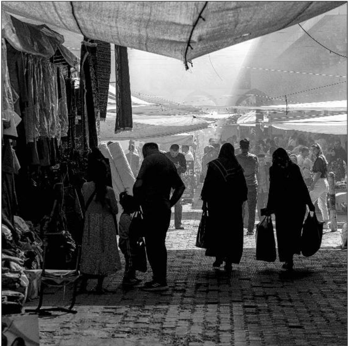
23 - Tashkent