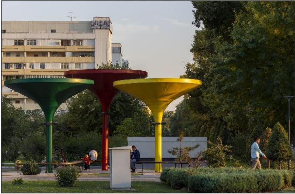
06 - Tashkent