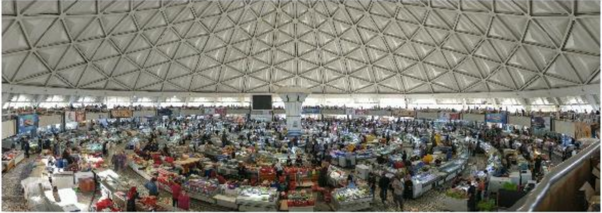
19 - Tashkent