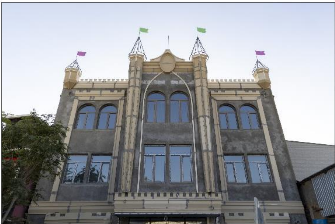
11 - Tashkent