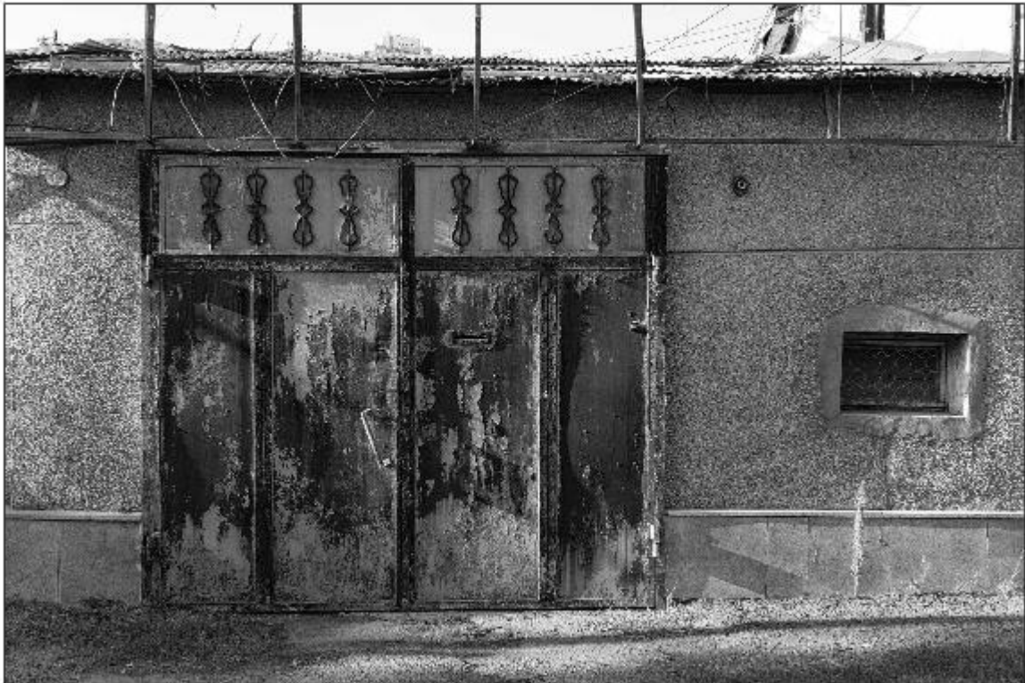
08 - Tashkent