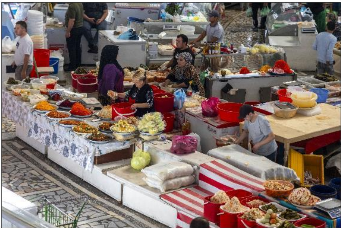
22 - Tashkent