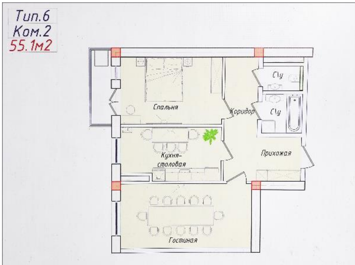
13 - Tashkent