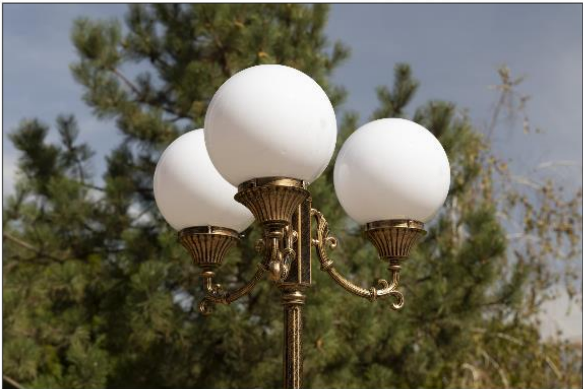
01 - Tashkent