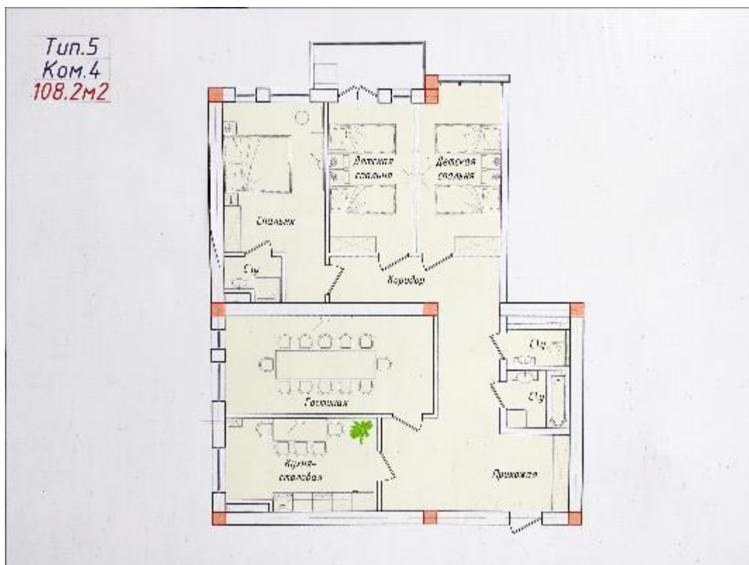
15 - Tashkent