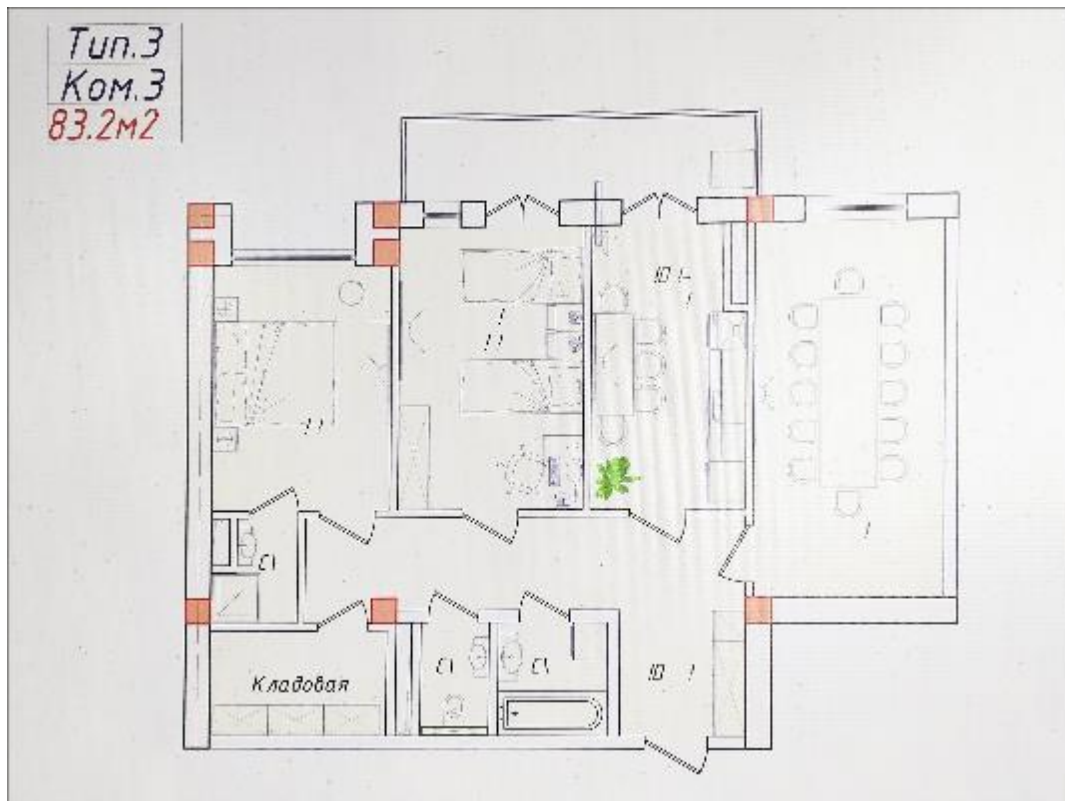
14 - Tashkent