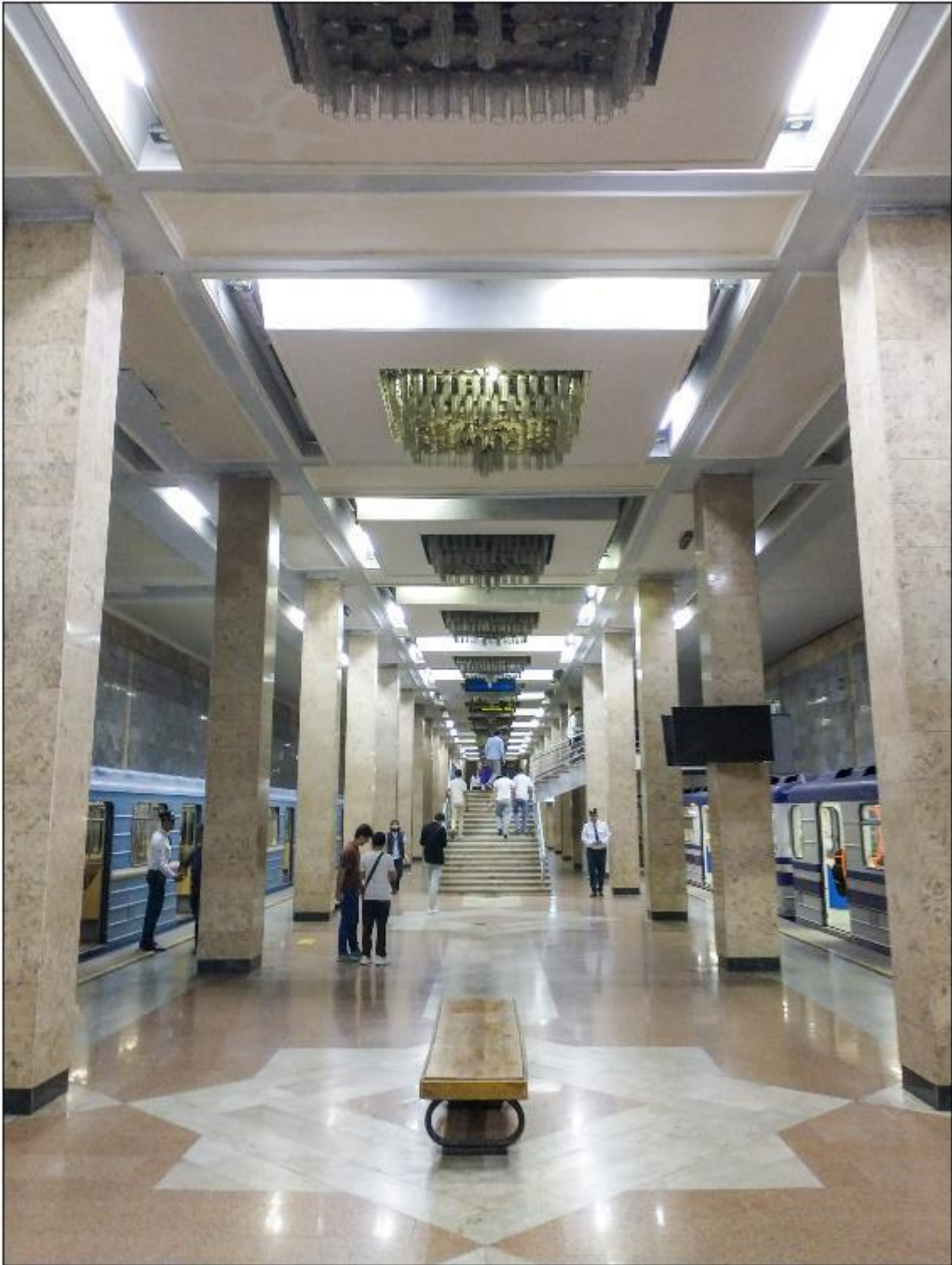
18 - Tashkent