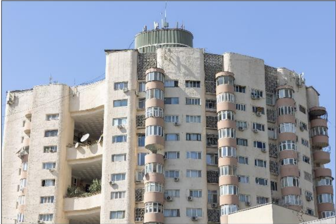
05 - Tashkent