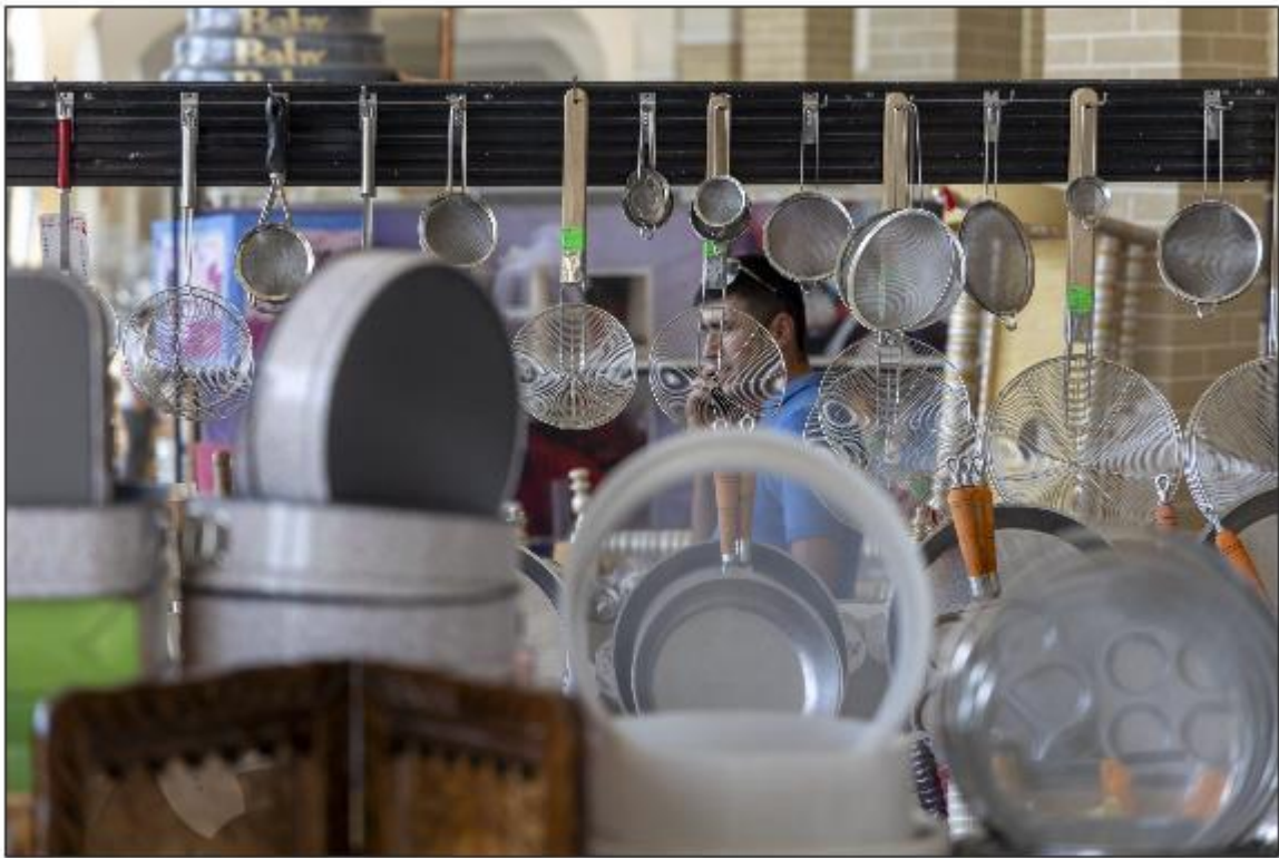
20 - Tashkent