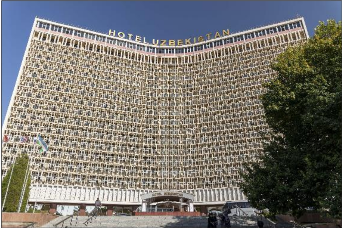
02 - Tashkent