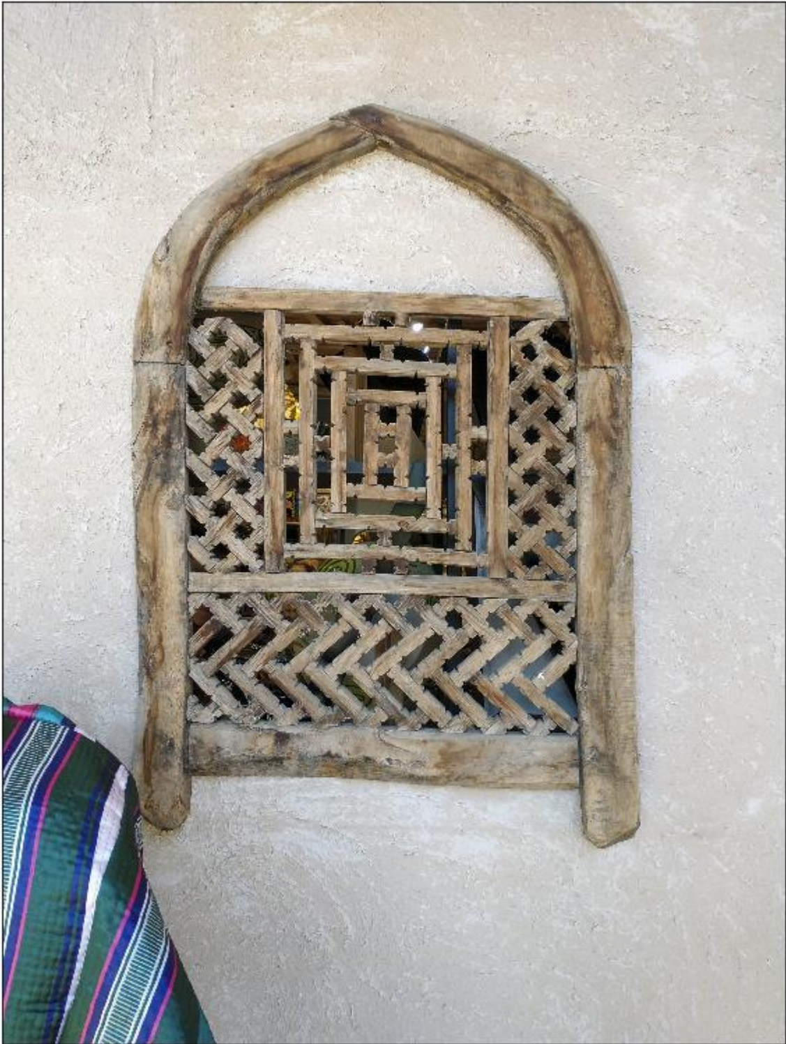
02 - Tashkent