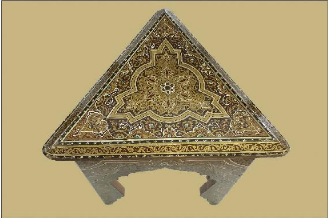
06 - Tashkent