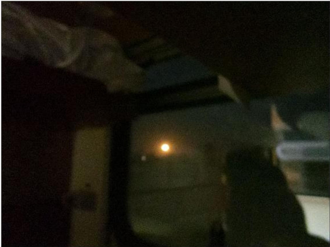
The moon at night through a train window

Posted on 2024-04-19 2024-04-19 by spd_wp_admin