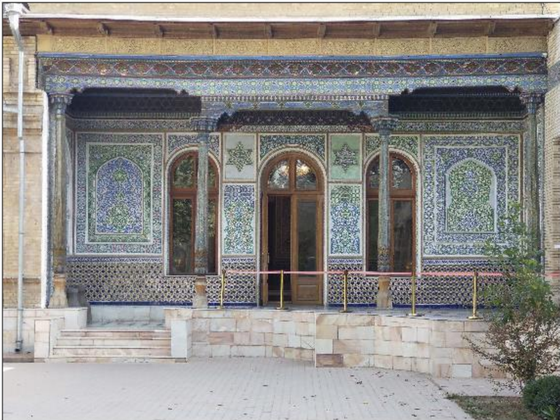
01 - Tashkent

[1] – Quoted from https://en.wikipedia.org/wiki/Tashkent