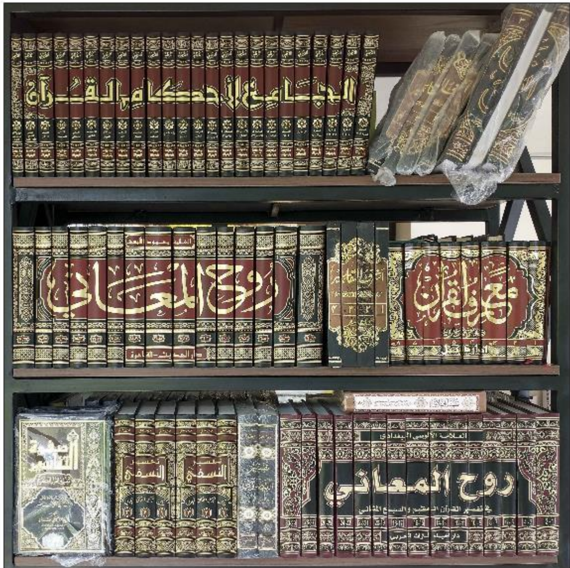
09 - Tashkent