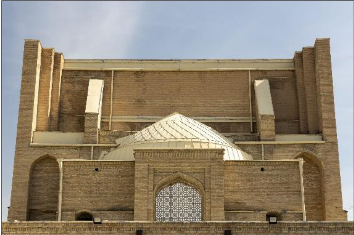
08 - Tashkent