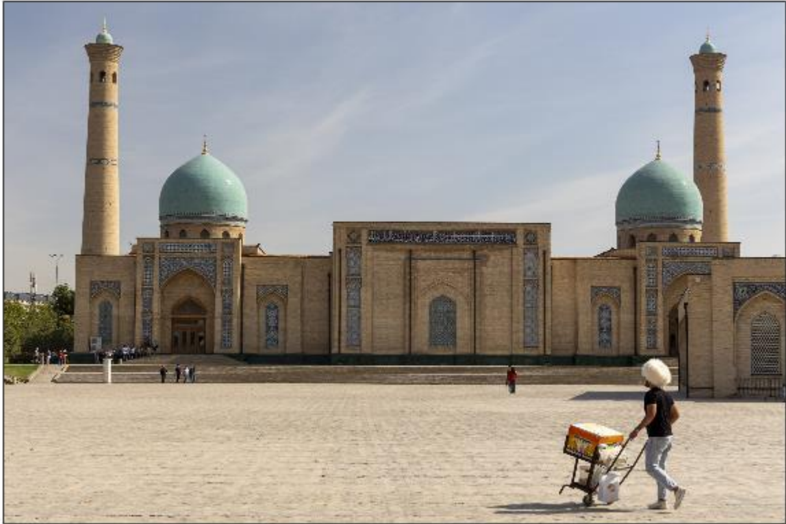
07 - Tashkent