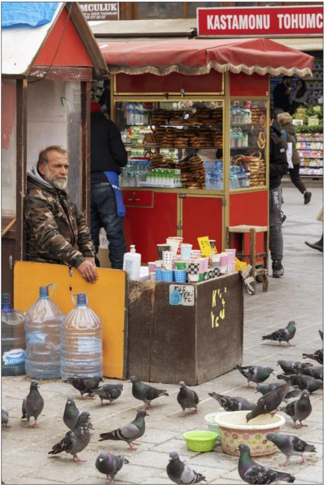
Istanbul - Spice Market - 5