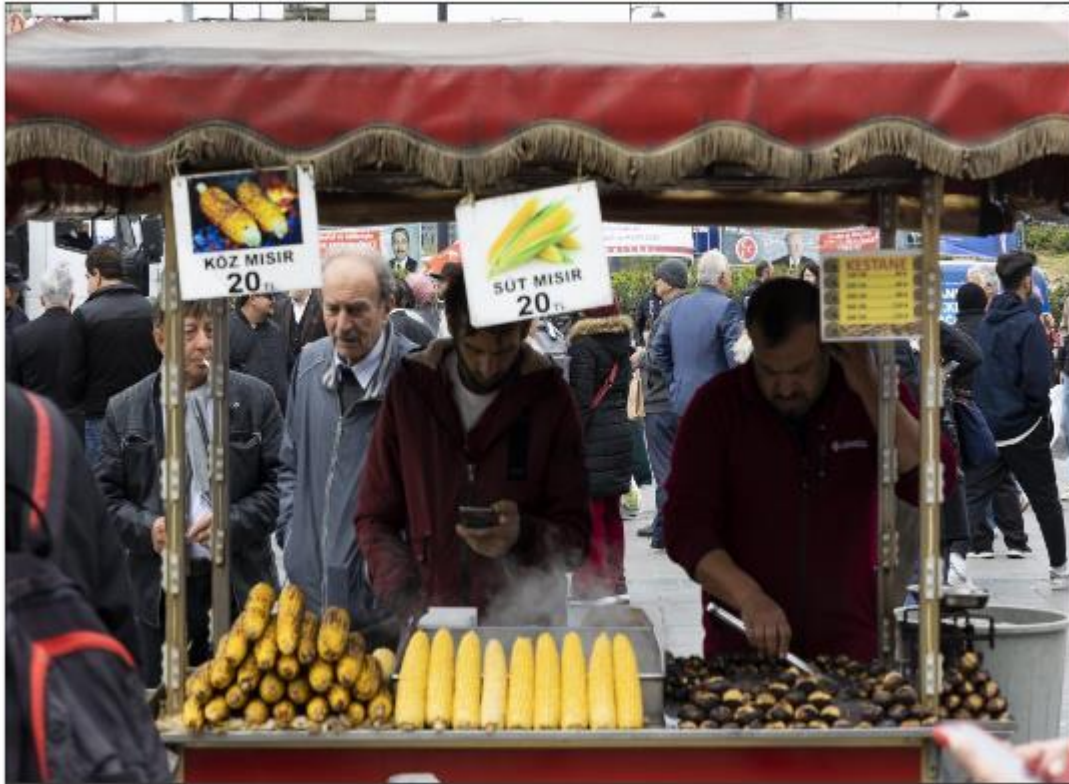
Istanbul - Spice Market – 4