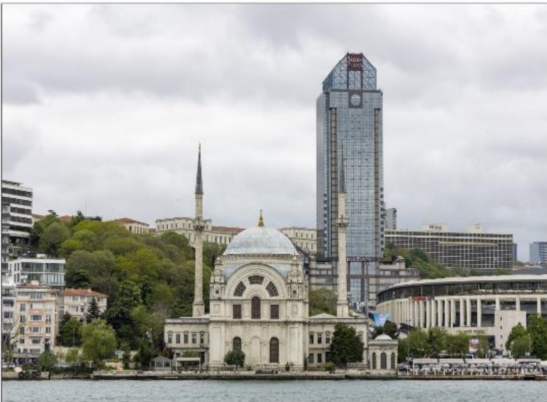
Istanbul - Bosphorus - 2