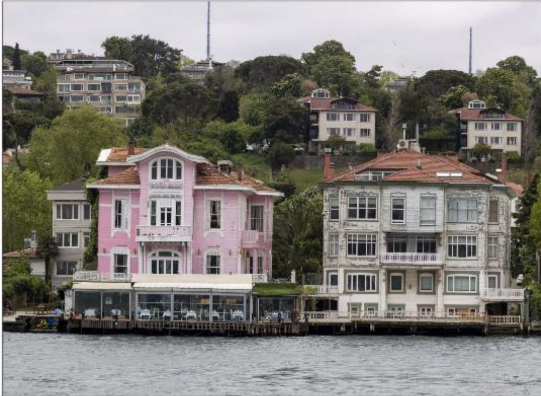
Istanbul - Bosphorus - 7