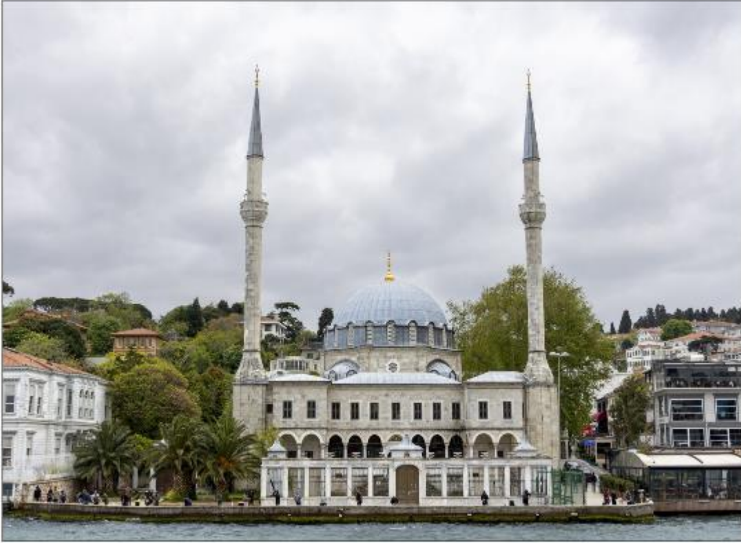
Istanbul - Bosphorus - 1