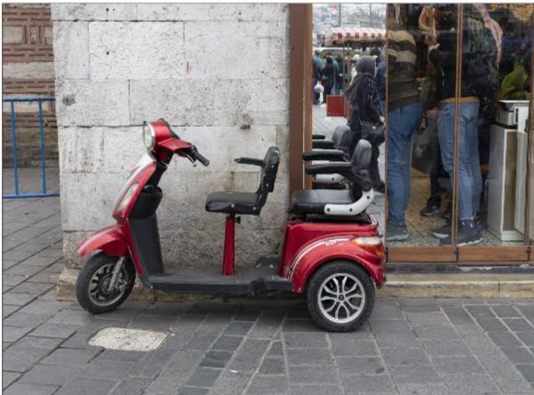
Istanbul - Spice Market - 7