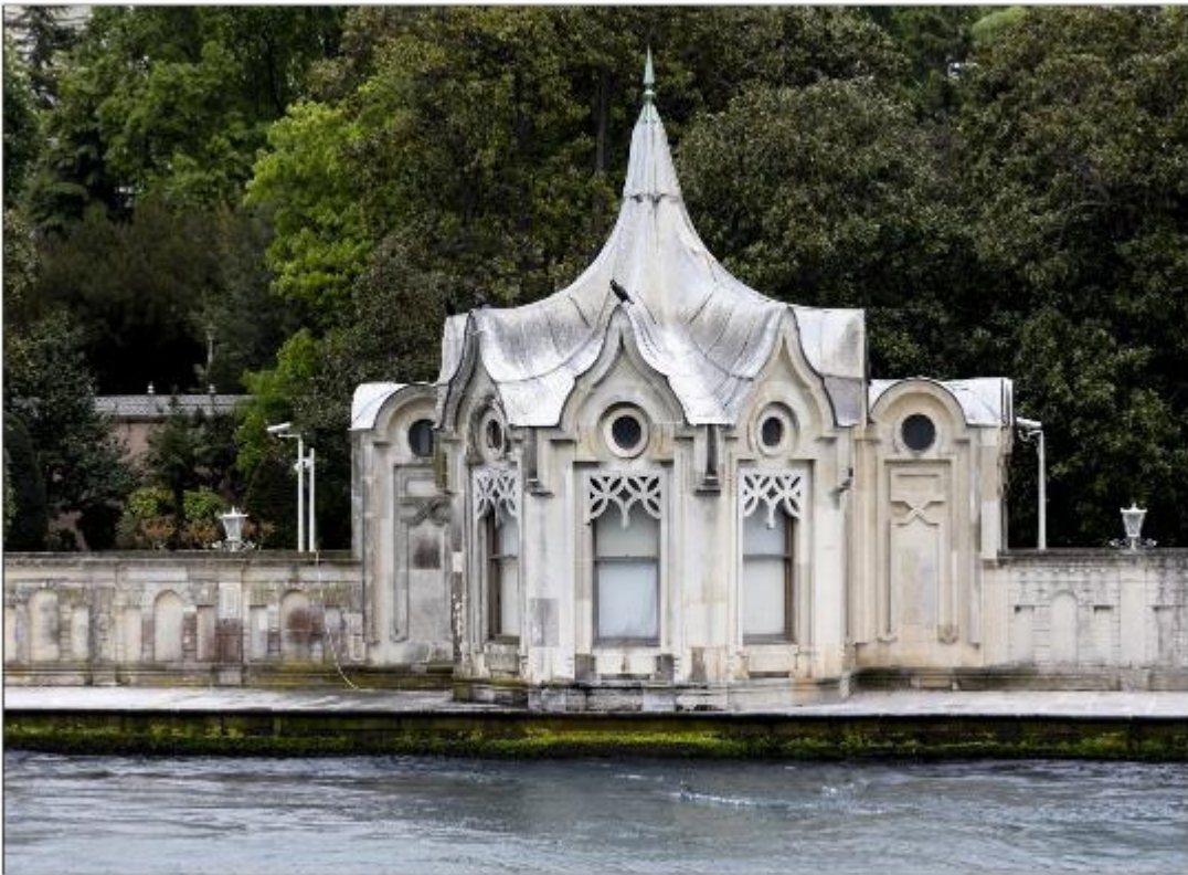
Istanbul - Bosphorus - 4