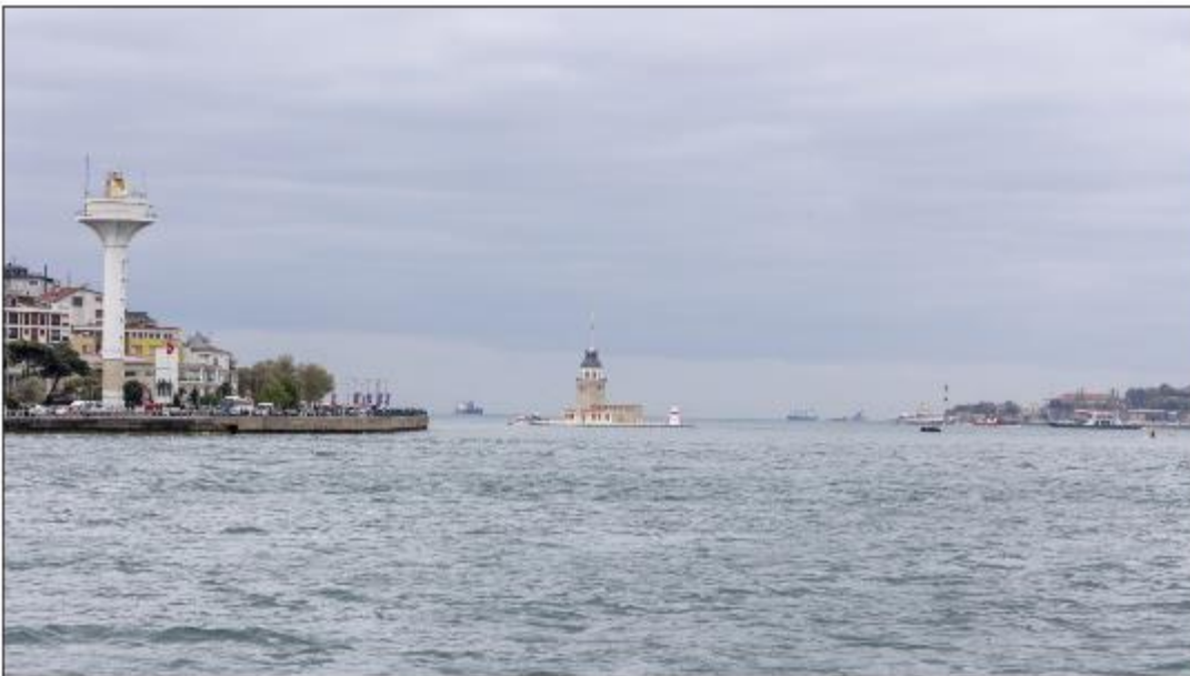
Istanbul - Bosphorus - 8