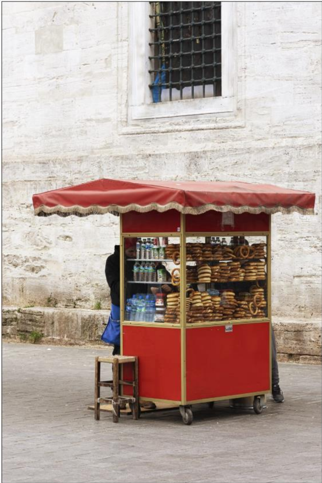
Istanbul - Spice Market - 6