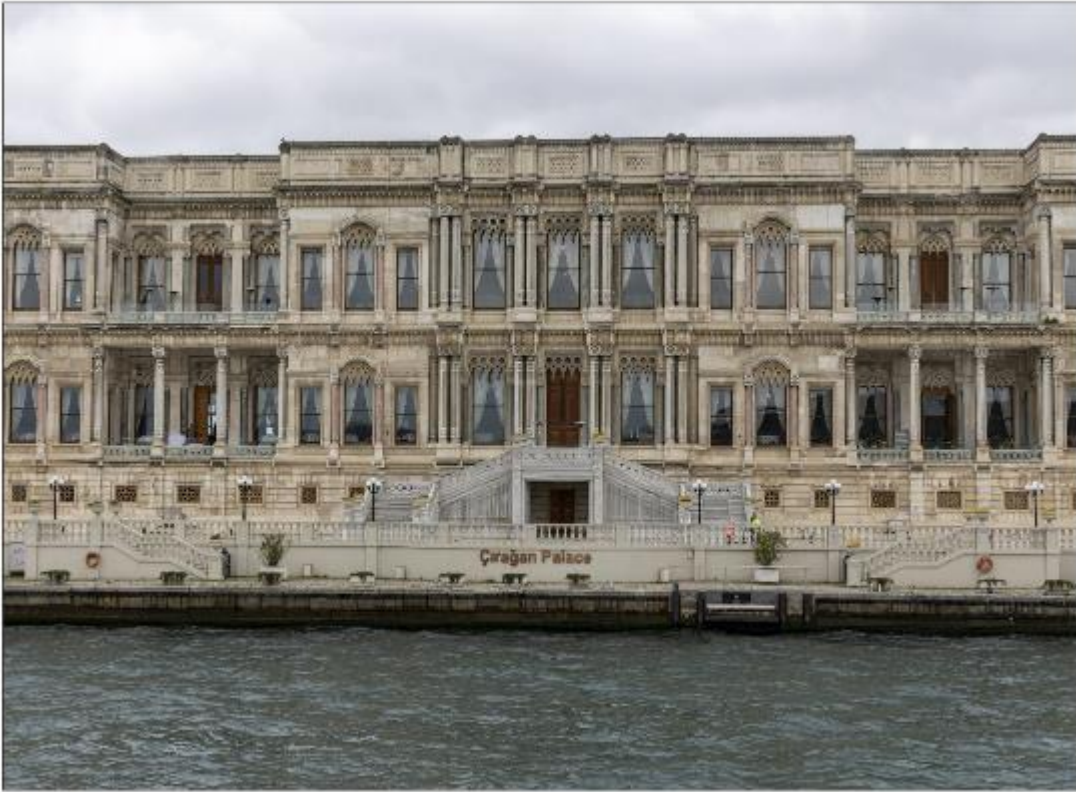
Istanbul - Bosphorus - 3