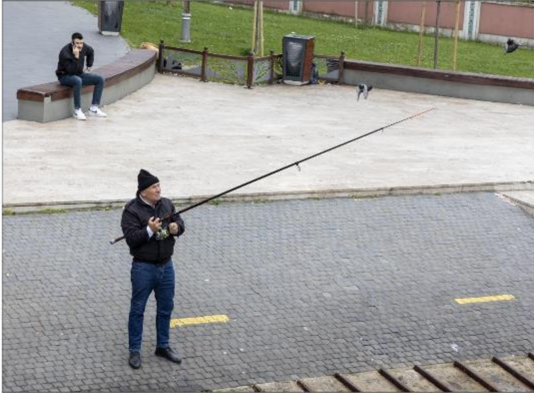
Istanbul - Bosphorus - 5