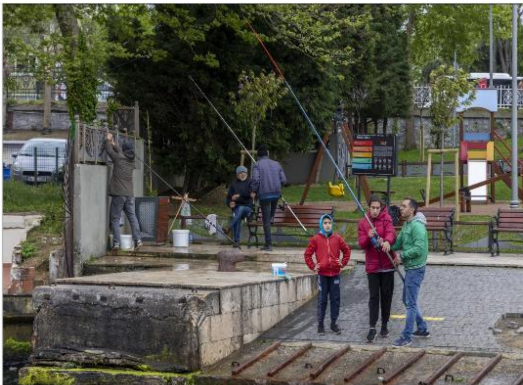
Istanbul - Bosphorus - 6