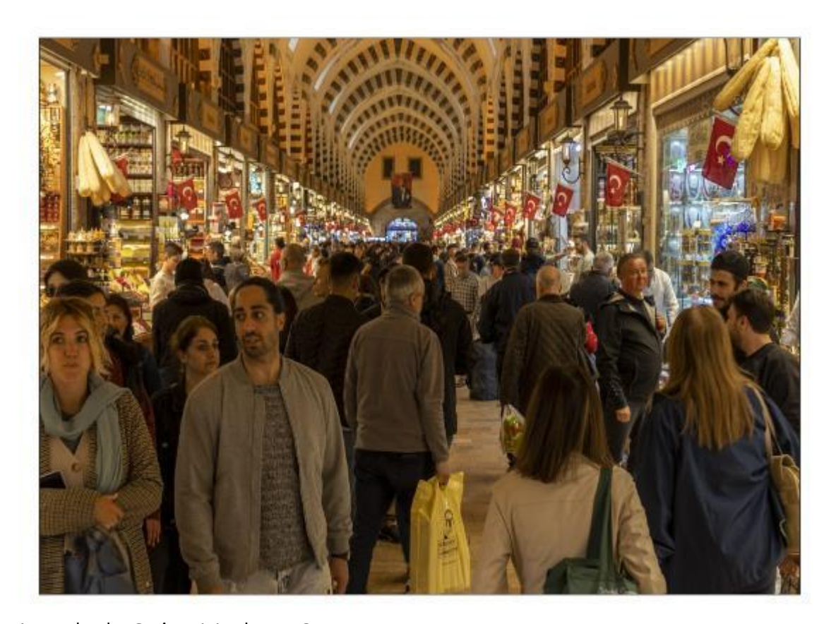
Istanbul - Spice Market - 2