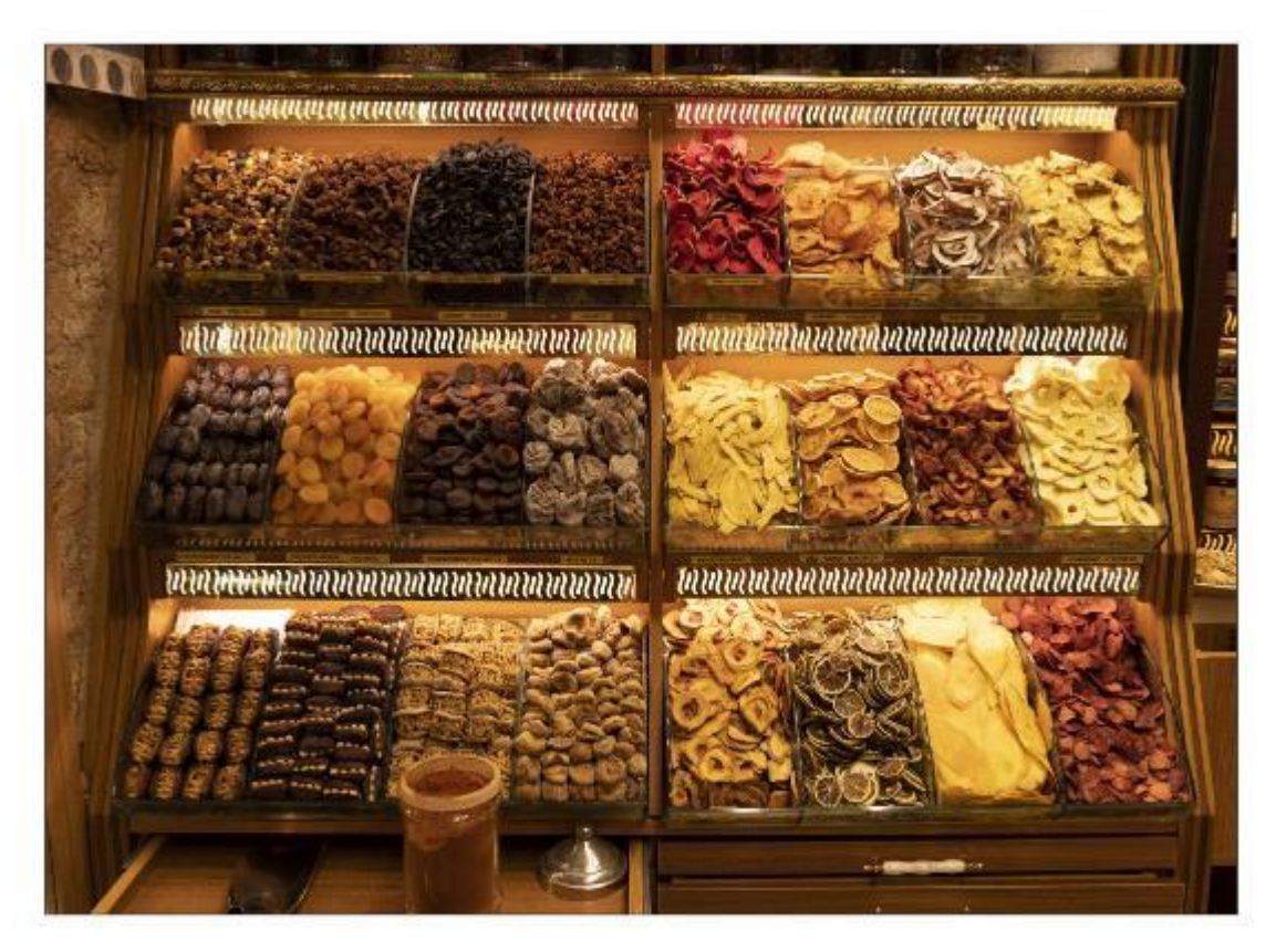
Istanbul - Spice Market - 3