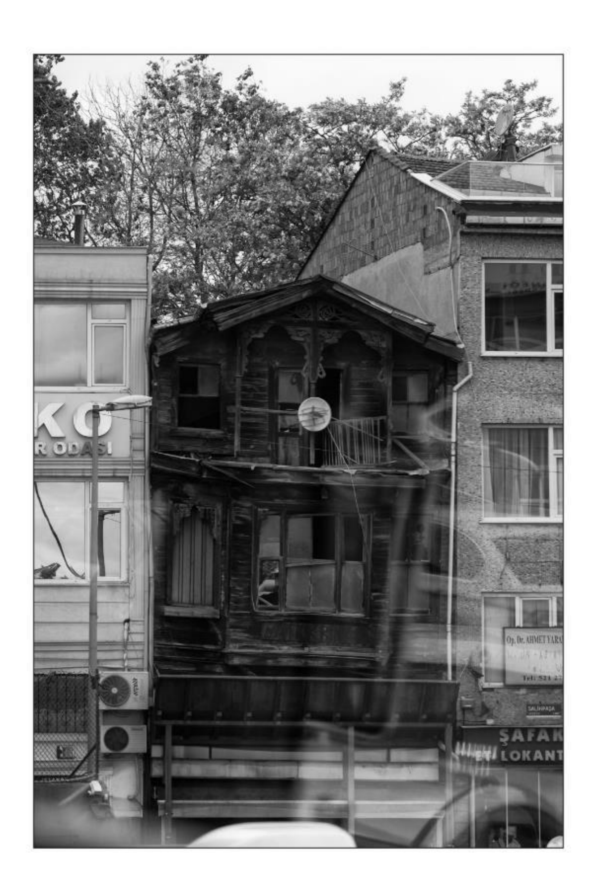
Istanbul - Through A Bus Window - 4