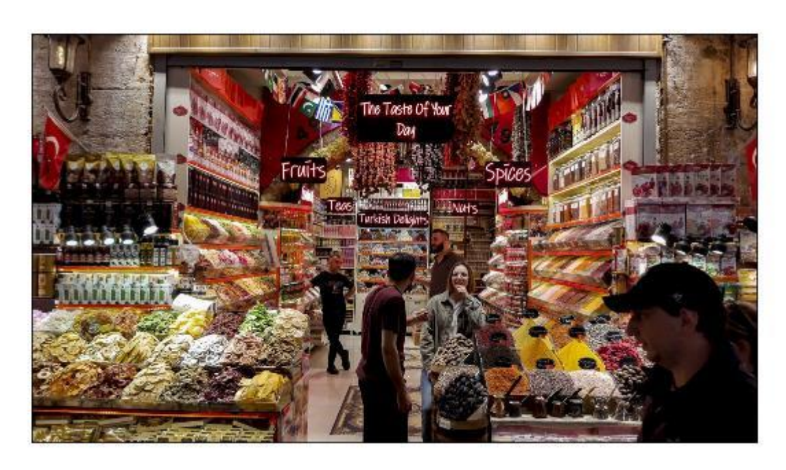
Istanbul - Spice Market - 1