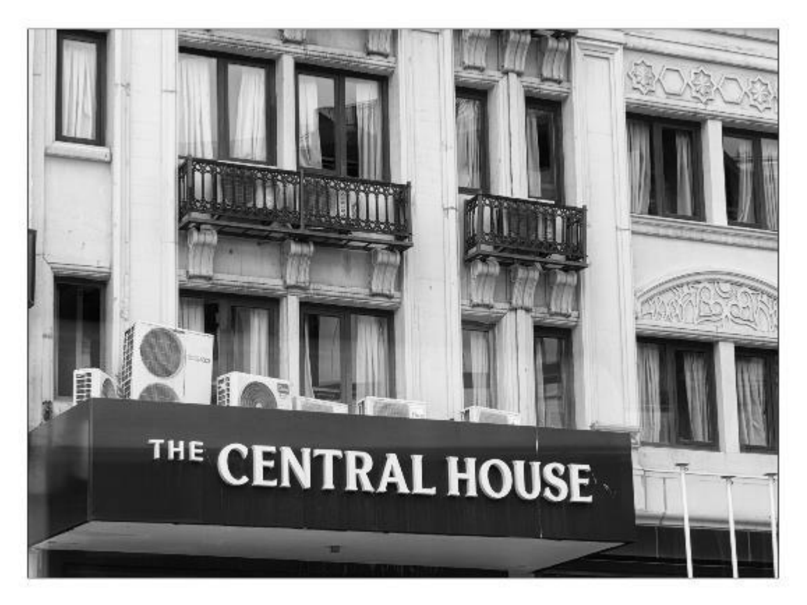
Istanbul - Through A Bus Window - 1