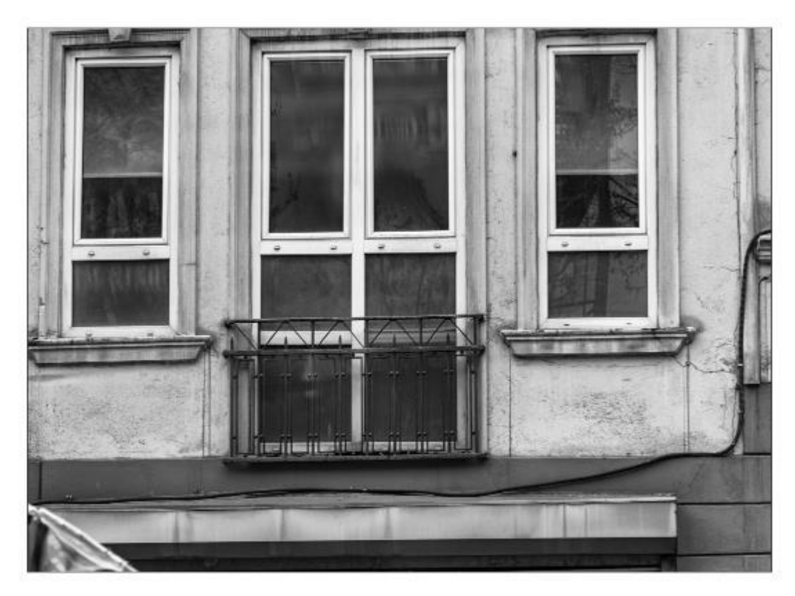
Istanbul - Through A Bus Window - 2