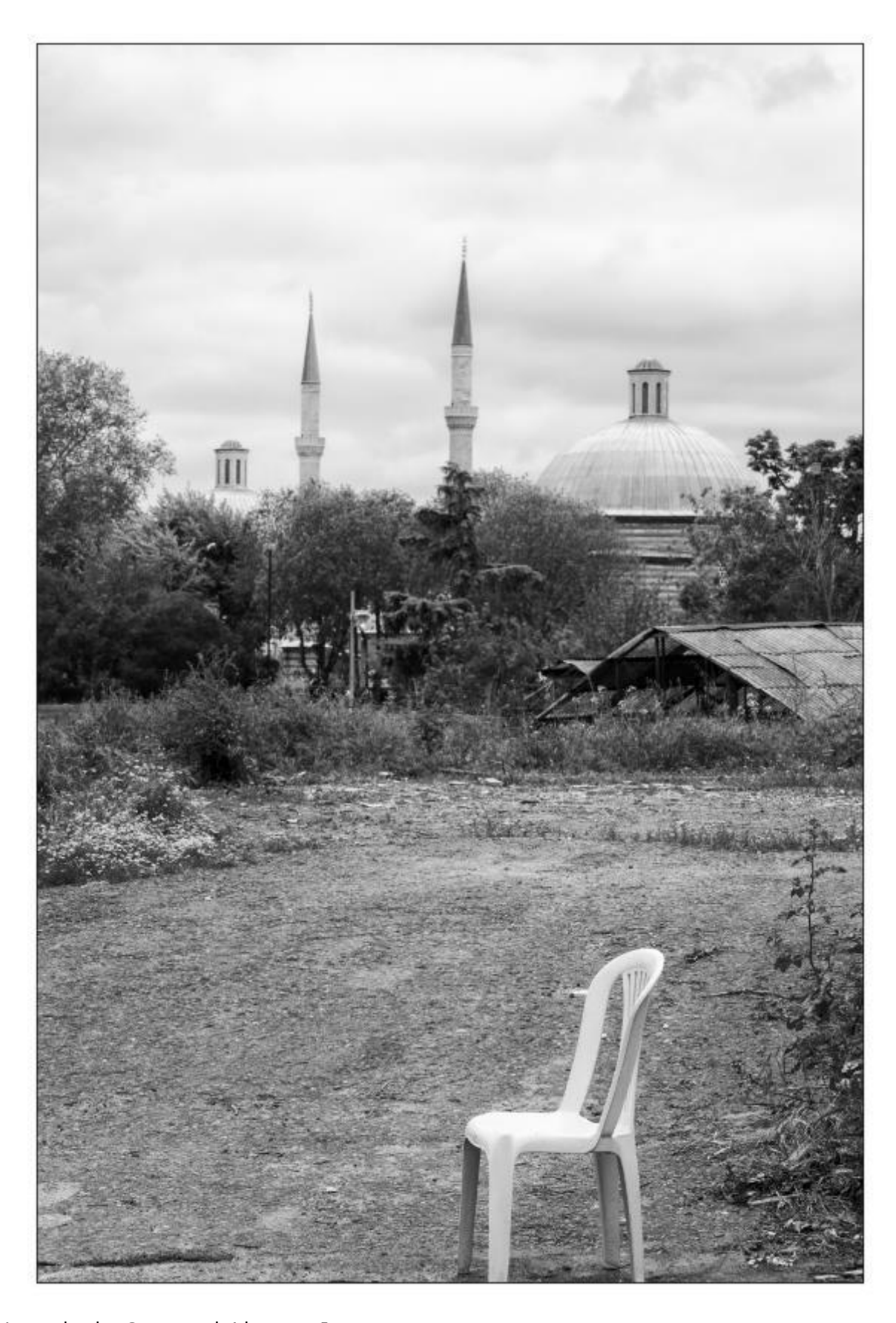
Istanbul - Out and About - 1