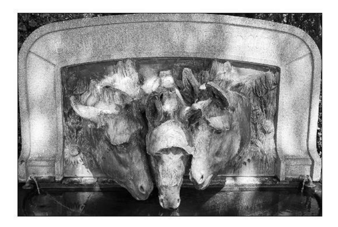
01 - Lausanne

Posted on 2023-04-05 2023-04-06by spd_wp_admin