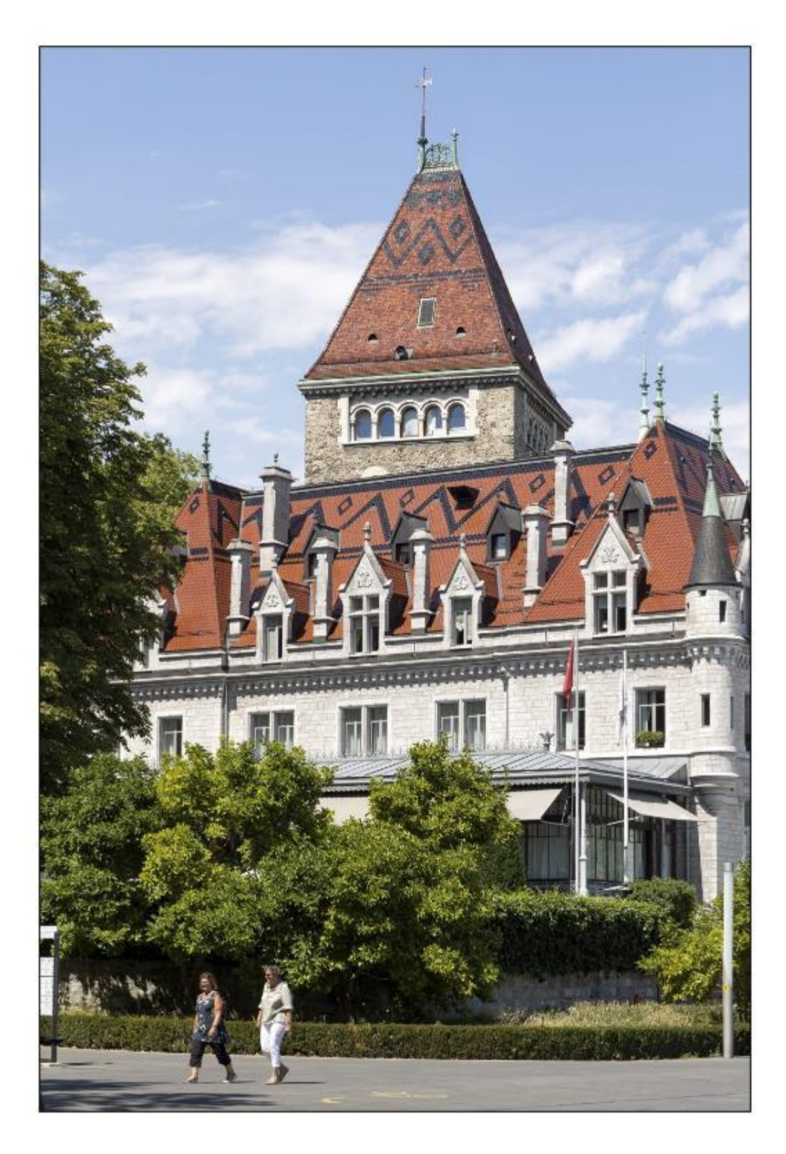
02 - Lausanne