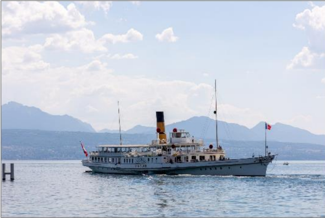
02 Not My Boat for Crossing Lake Geneva / Lac Lemman