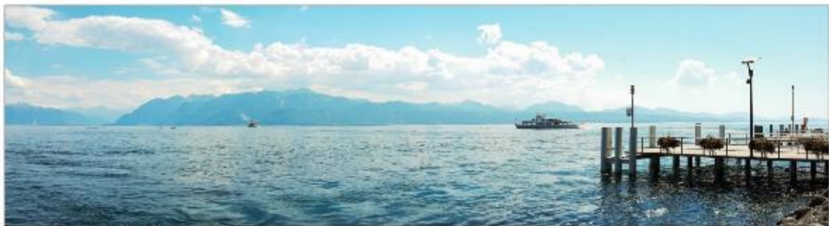
01 Looking From Lausanne to Evian