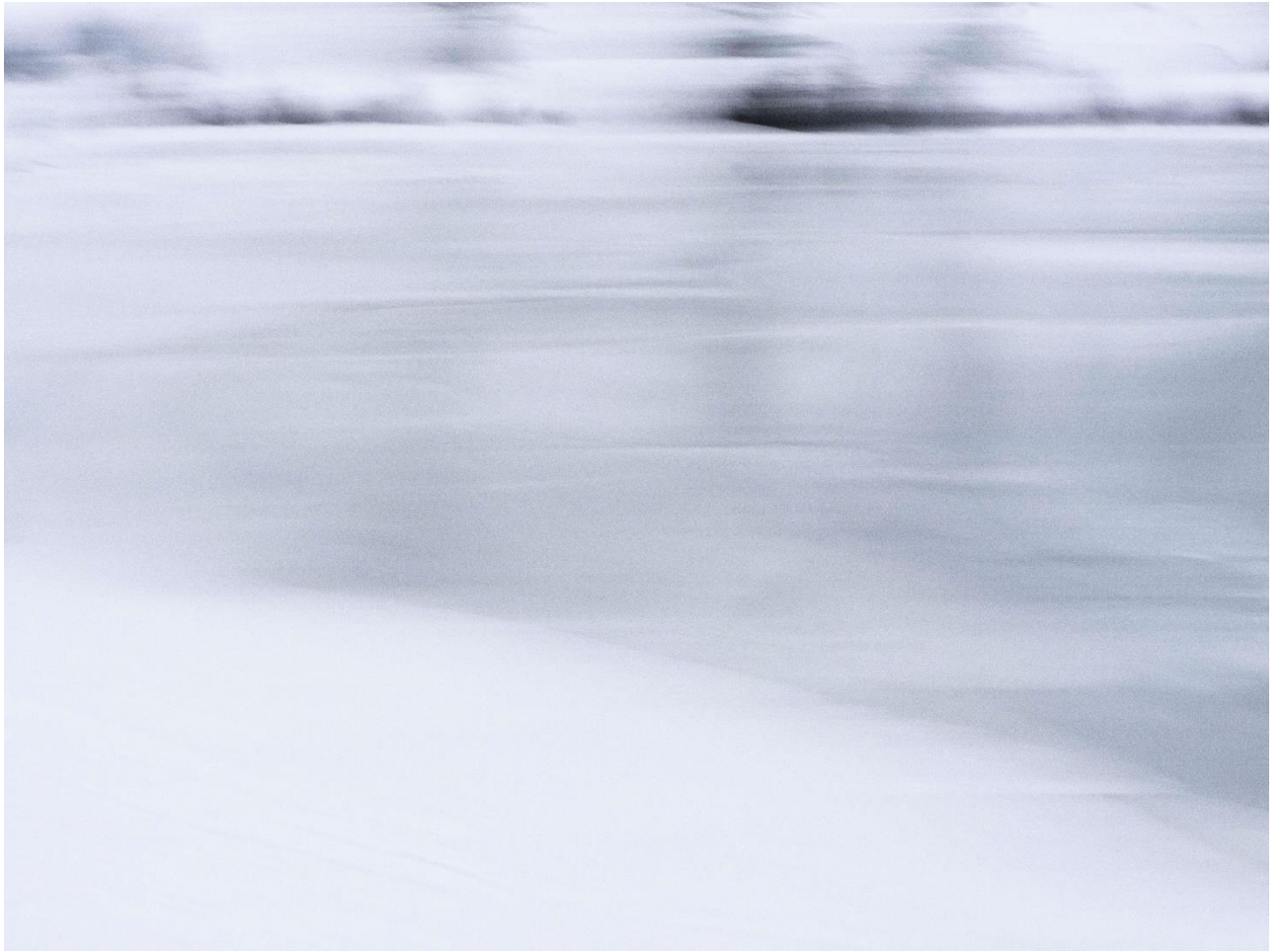
Second Set – Two Jack Lake – captured 2019-12-18