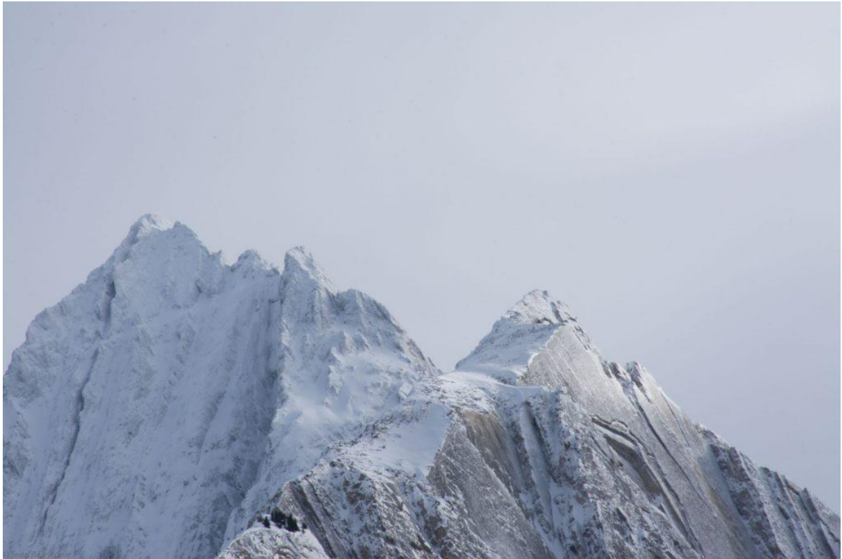
Johnston Canyon, Banff National Park 2017-01-20