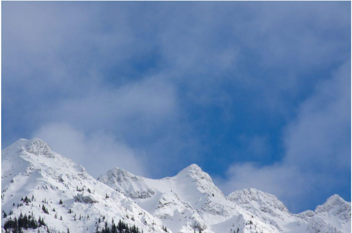
Johnston Canyon, Banff National Park 2017-01-20