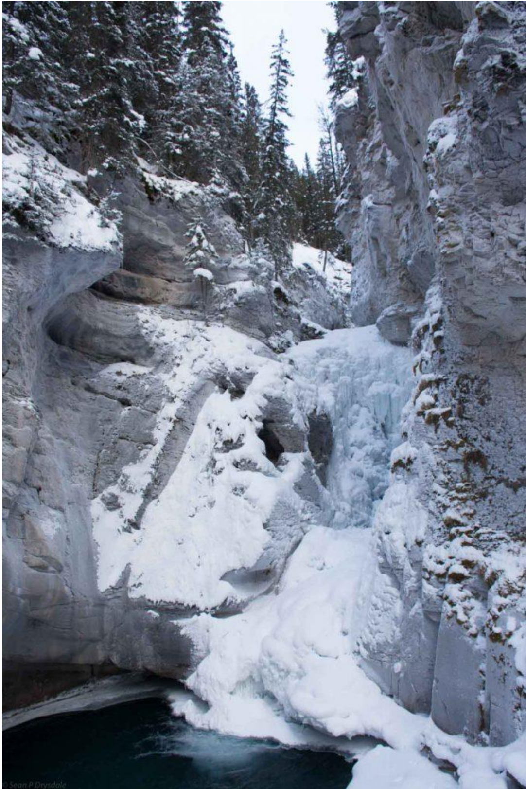
Johnston Canyon, Banff National Park 2017-01-20