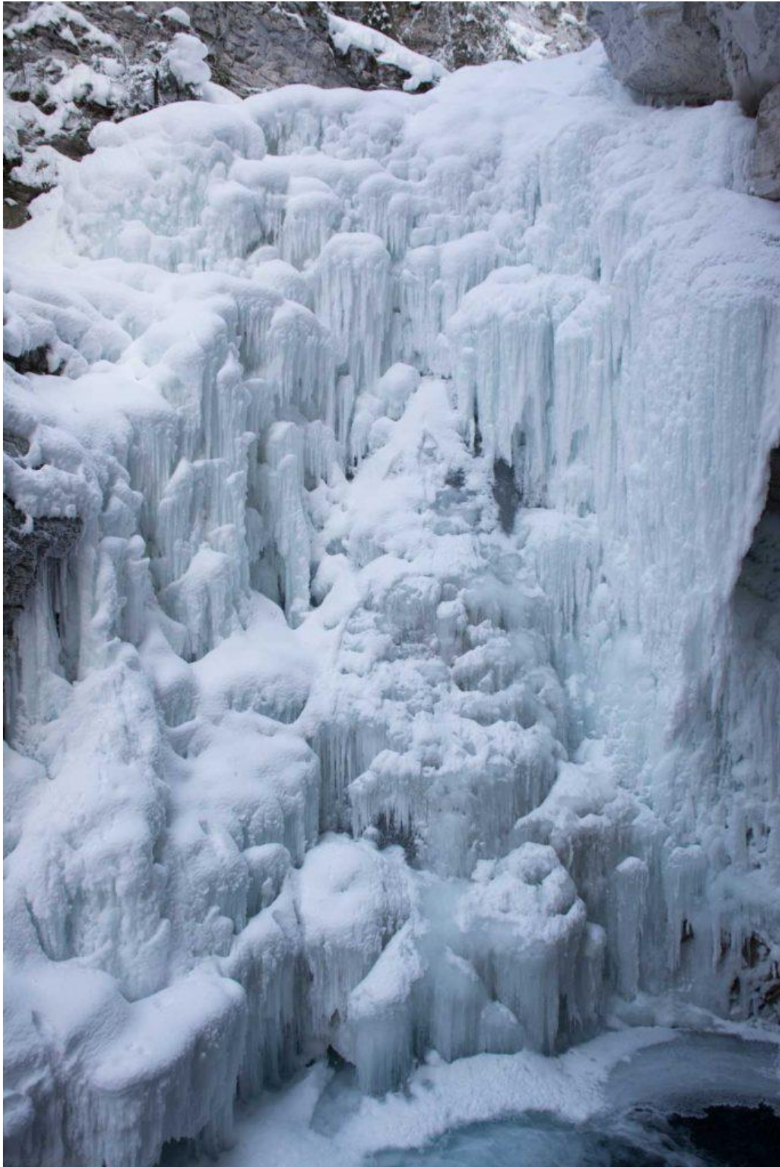
Johnston Canyon, Banff National Park 2017-01-20