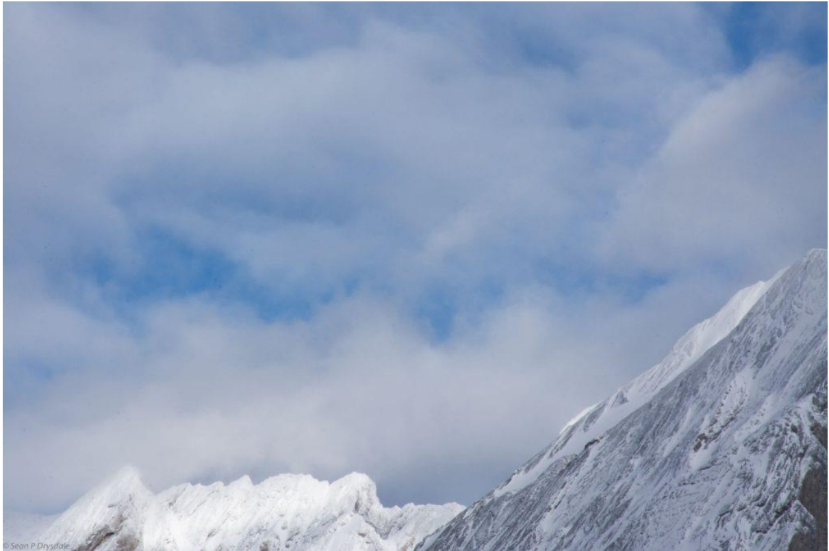
Johnston Canyon, Banff National Park 2017-01-20