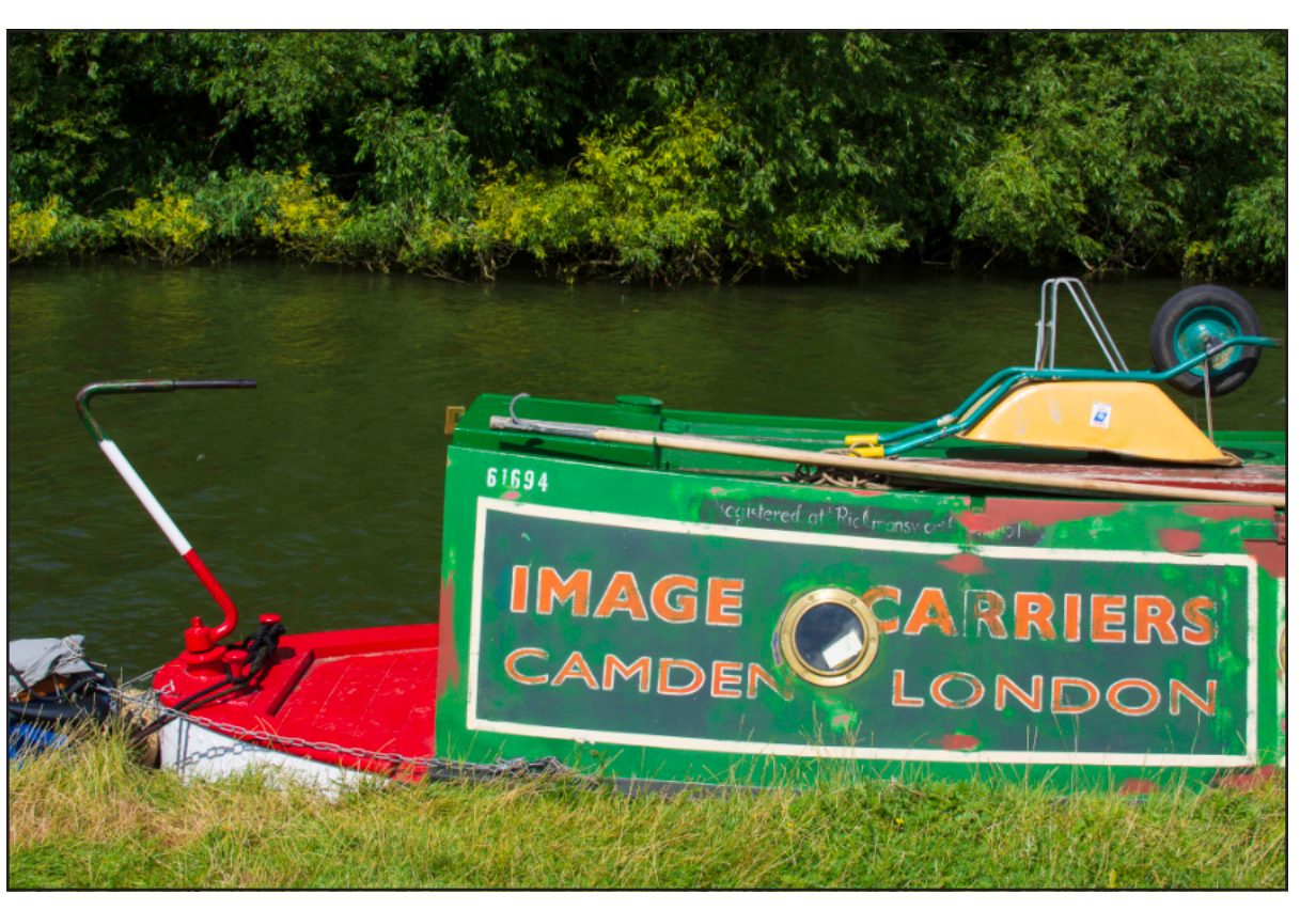
River Thames, Abingdon

They are processing images by the barrowful.