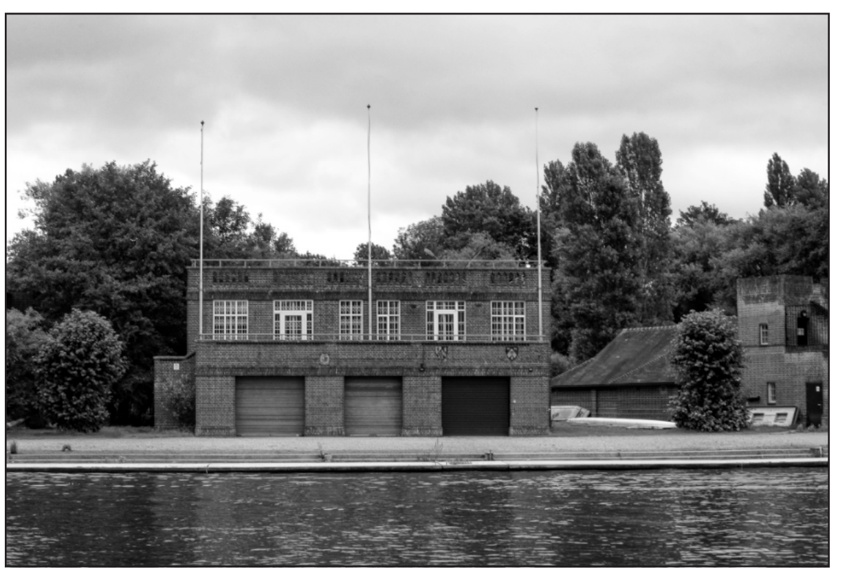
River Thames, Oxford