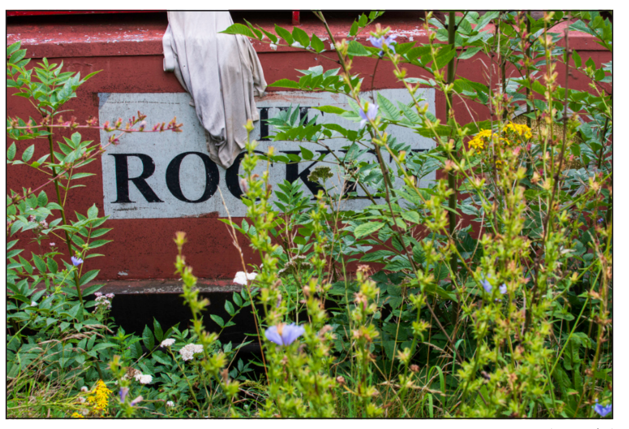
River Thames, Oxford

Branson's early experiment is in a bit of a shambles.