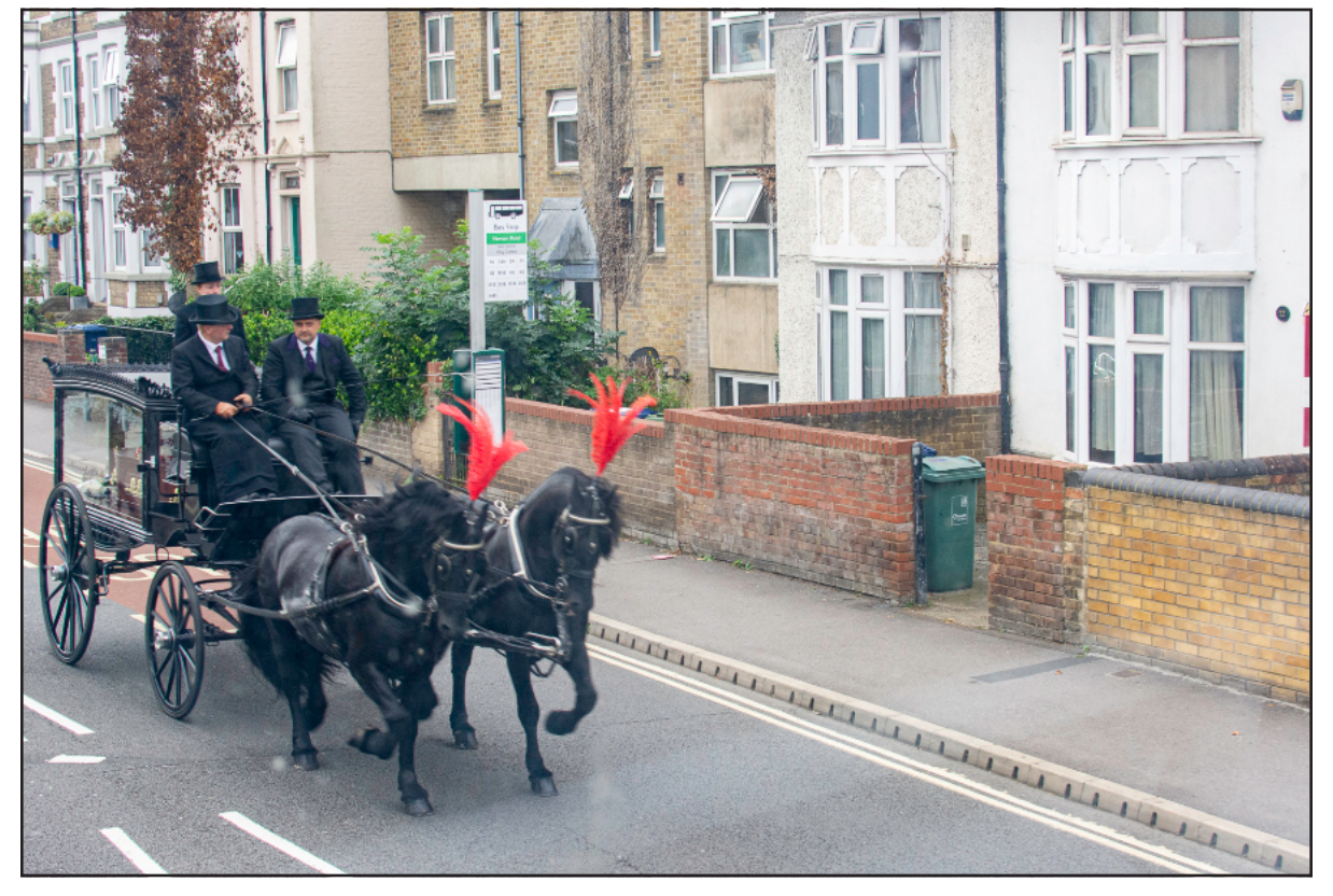
Oxford Through a window of a double decker bus