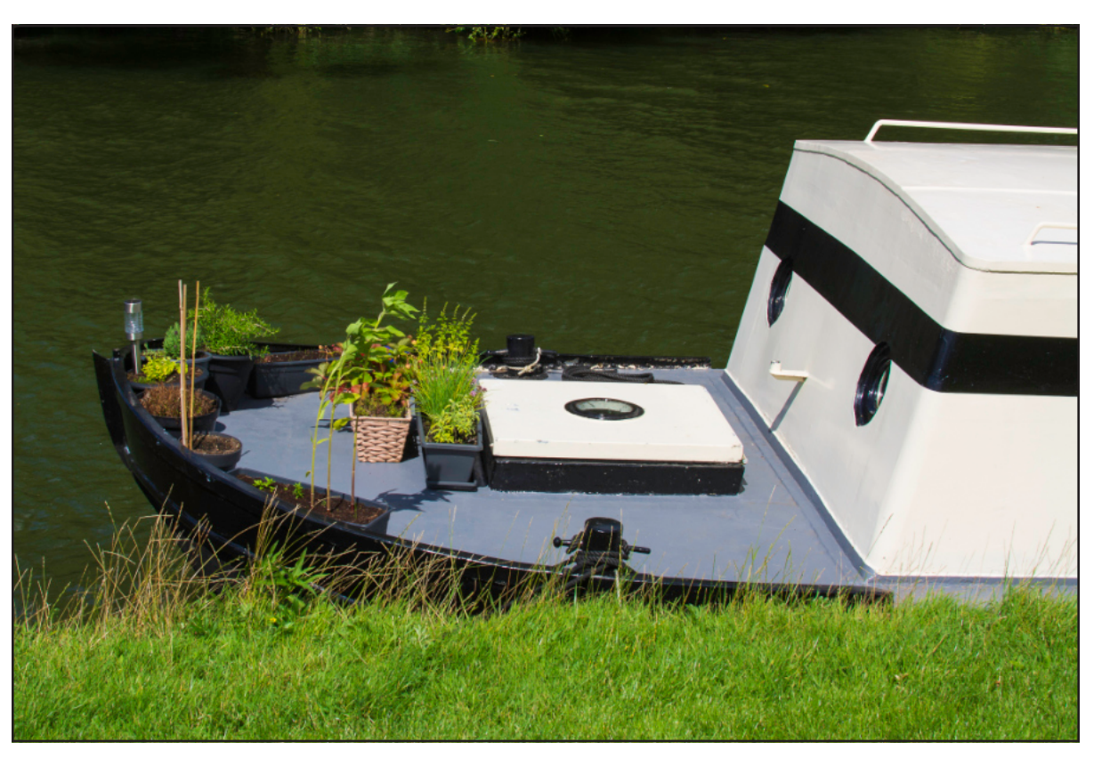
River Thames, Abingdon