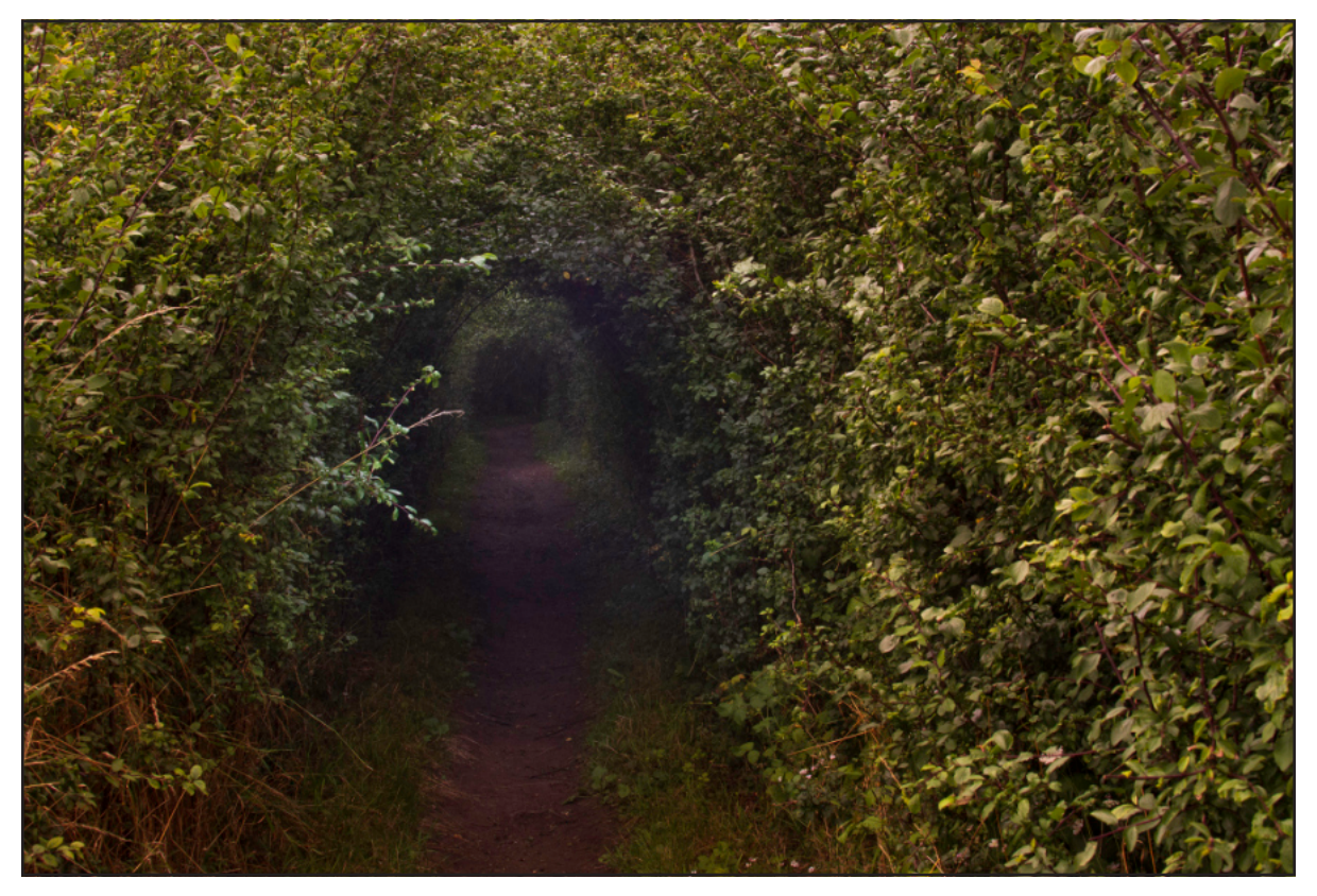
Radley, on the path to Sandford Lock