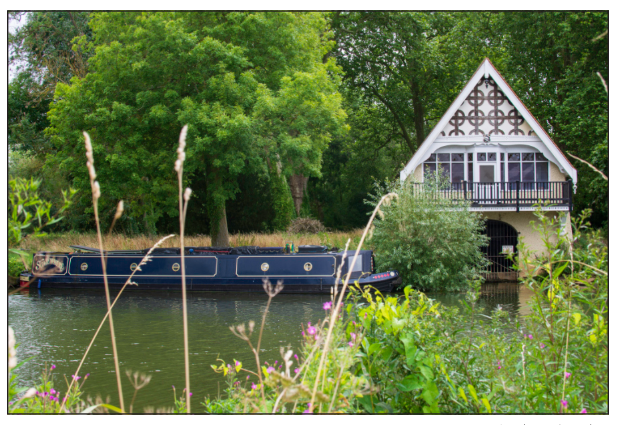
River Thames, Somewhere