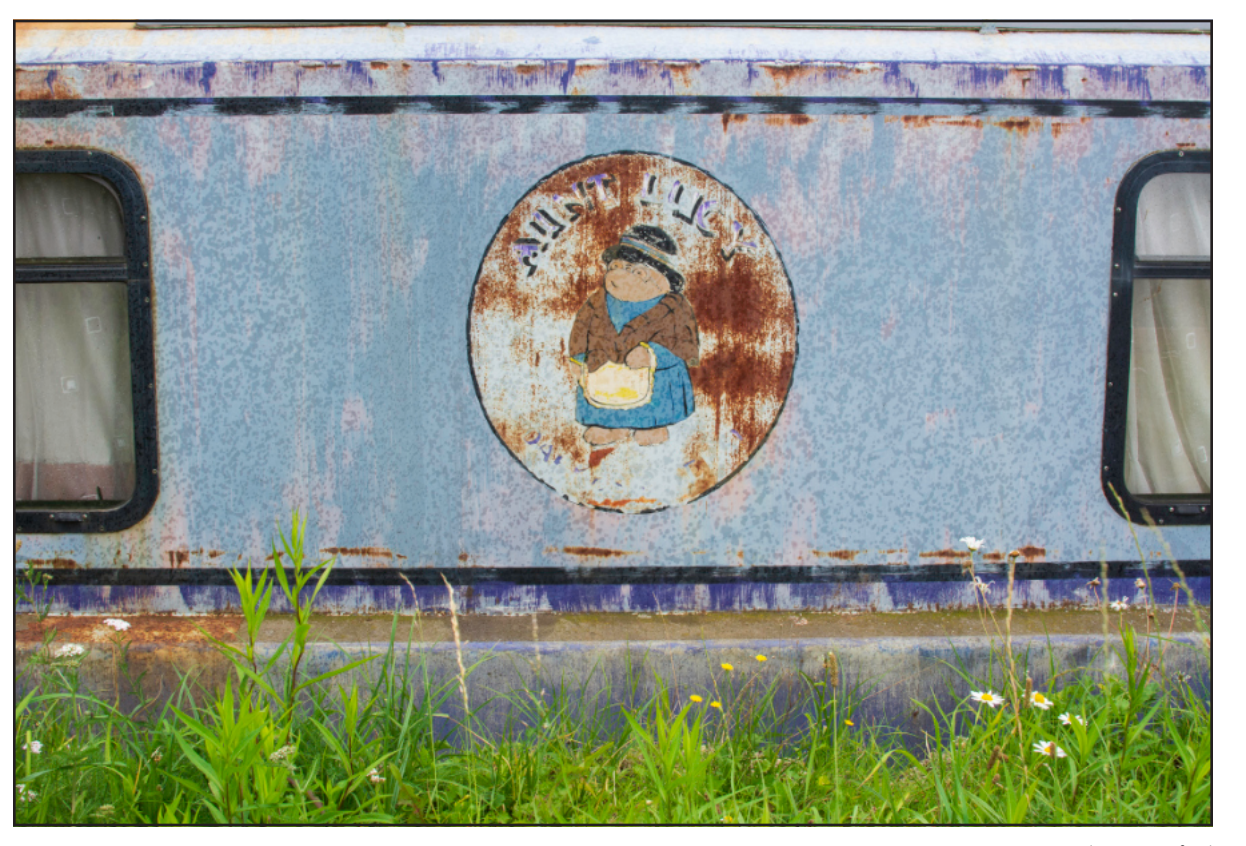
River Thames, Oxford